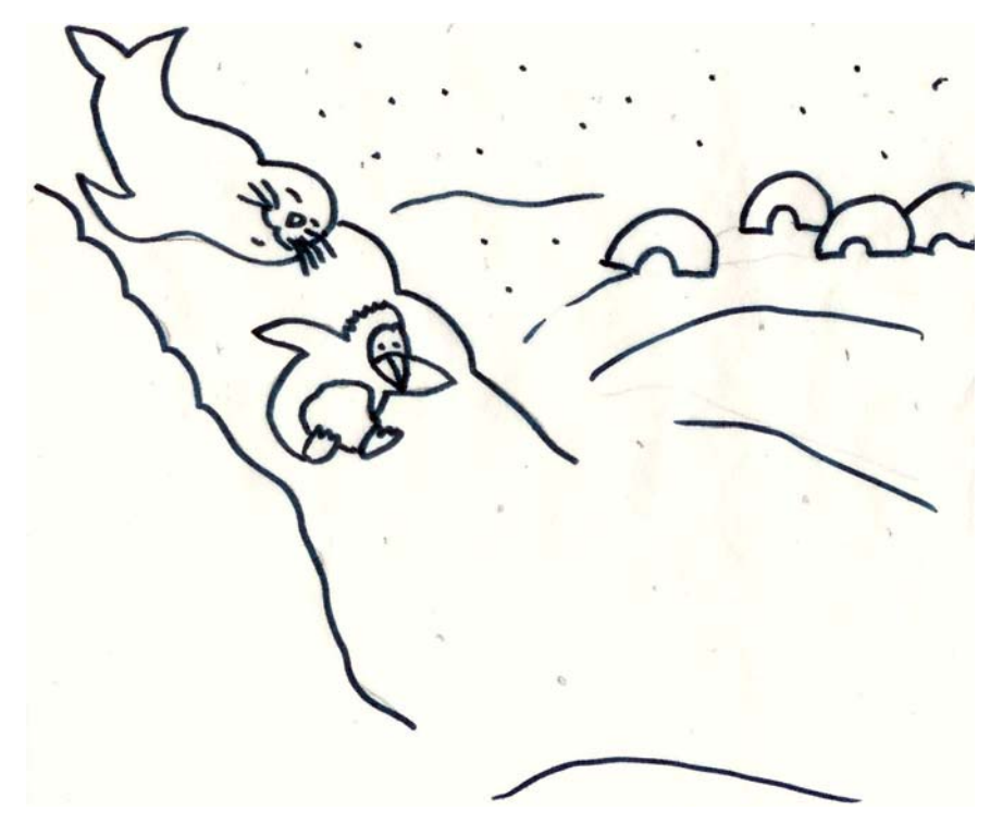
In a cold country, called the Frozen Land, lives <u>Hector</u>, a little snowman.